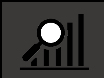
Meeting point for leading companies of the sector