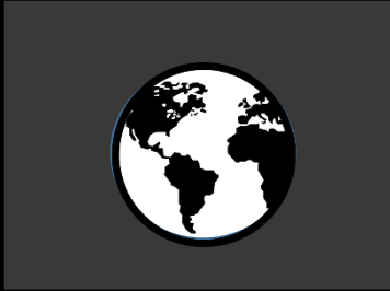
International reference congress